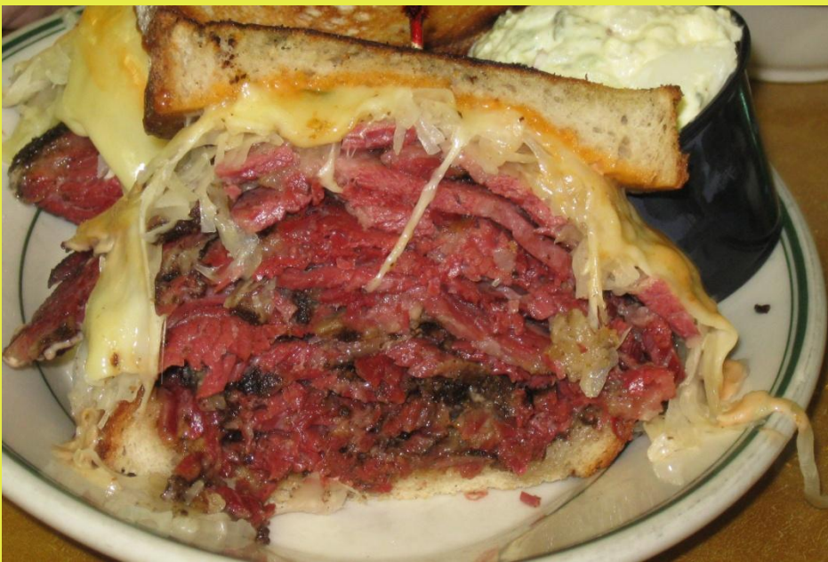
Pastrami reuben with cole slaw.

We also had a side order of fries. These were thick and crispy. Perfect for dousing with vinegar.