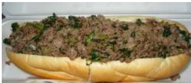
THIS ONE WITHOUT ONIONS