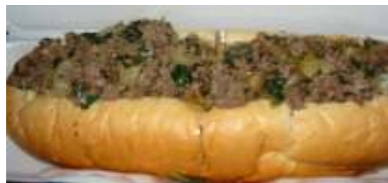
THIS ONE WITH