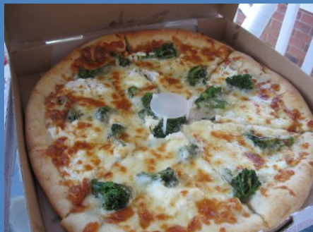
White with broccoli

Located very close to the end of the island this is worth the delivery or trip. Recommended to us by lifelong Wildwoods goers this is what we rank as the best pizza in all the Wildwoods. Thin crust style with a great taste. Unless you live by the edge of the island you can get it delivered. We have been told that the Sicilian is even better than the thin crust. You better believe we will find out.